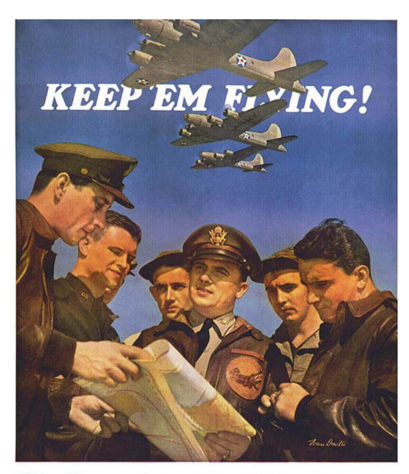
Air Crews Are Vital For Victory